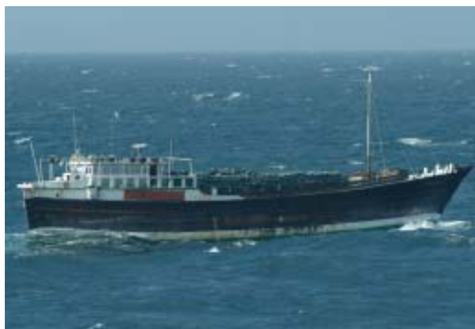
MSV Bhakti Sagar

Indian merchant vessel MSV Bhakti Sagar while transiting off the coast of Somalia on 27 Feb 06 was attacked by the pirates armed with weapons using two speed boats in position about 31 NM off Mogadishu. The vessel alongwith all 21 crew members was hijacked by the pirates and taken to Hararadere in the vicinity of a suspected pirates camp. The vessel was later released by the pirates on 29 Mar 06.