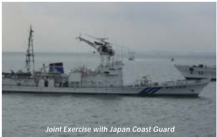
Joint Exercise with Japan Coast Guard