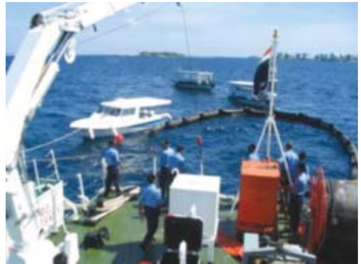
Joint Exercise with Maldives, NSS (Coast Guard)

ICG ships Vighraha and Annie Besant visited Male, Maldives from 20 Dec to 25 Dec 05, to participate in the VIIIth combined exercise between the ICG & National Security Service (Coast Guard) of Maldives. The visit further strengthened the cooperation between the two agencies in the field of SAR and antipiracy measures.