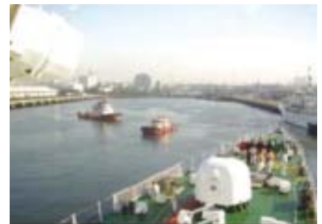
ICGS Samar entering Manila Harbour

ICG Ship Samar visited Japan, Korea and the Philippines from 30 Oct to 09 Dec 05 and