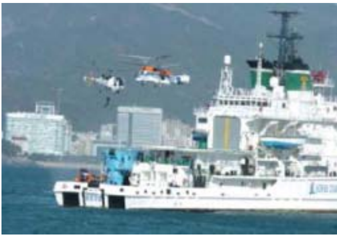
ICG-KCG Exercise off Busan

participated in the combined exercises to develop mutual cooperation on SAR and anti piracy measures. During the visit of the ship, high level interaction were also undertaken towards working out framework of maritime cooperation. This also included the maiden visit by an ICG ship to South Korea.